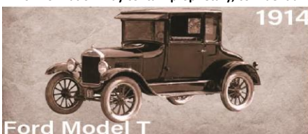
Ford Model T

This information may contain proprietary, confidential or privileged data or any matter which is subject to Intellectual Property Rights owned by Veedol International Ltd.