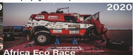
Africa Eco Race